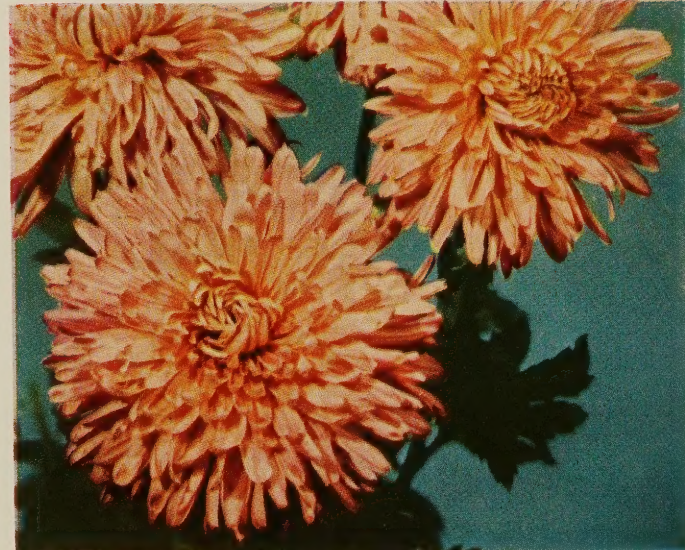
PATRICIA LEHMAN. 60c each; 3 for $1.50